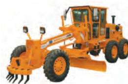
785 Motor Grader