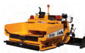
8515B Asphalt Paver